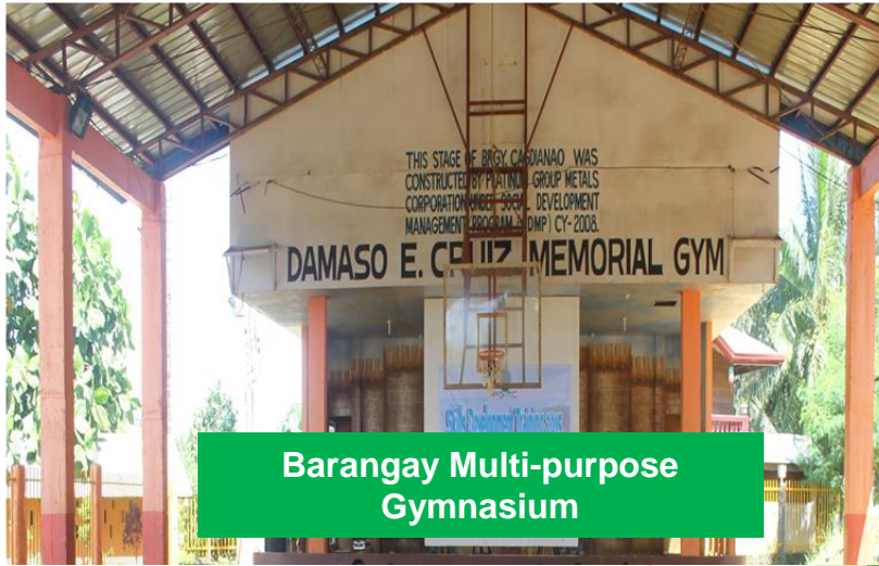
Barangay Multi-purpose Gymnasium