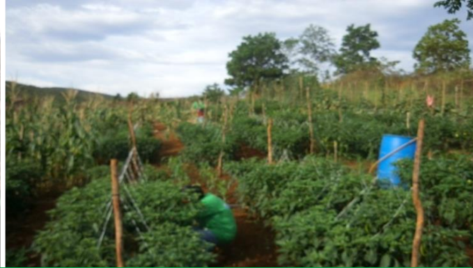
Vegetable Farm managed by Farmers' Association of Cagdianao (10 members)