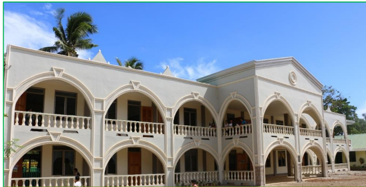
Completed 2-storey Hayanggabon Elementary School Building worth 7.5 million pesos.