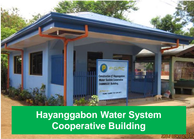
Hayanggabon Water System Cooperative Building