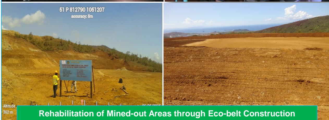
Rehabilitation of Mined-out Areas through Eco-belt Construction