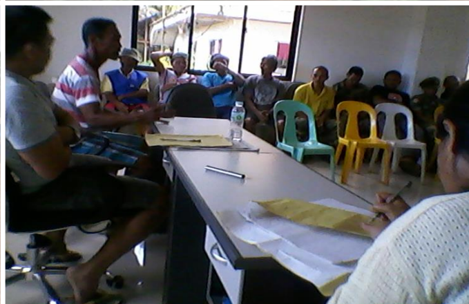
Provision of motorized bancas for the Cagdianao Fisherfolk Organization (45 beneficiaries)