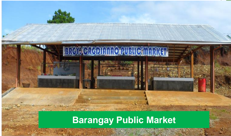
Barangay Public Market