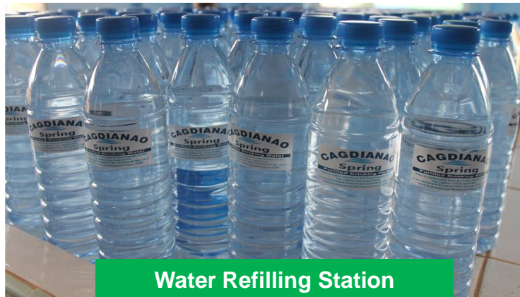
Water Refilling Station